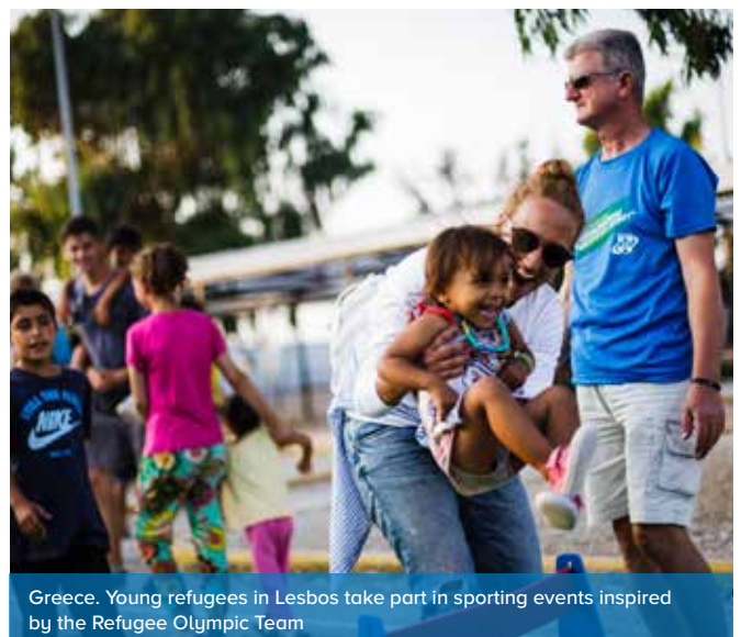
Greece. Young refugees in Lesbos take part in sporting events inspired by the Refugee Olympic Team

It's important for editors, reporters, sub-editors and photographers to realise that, when we get it wrong, people suffer directly