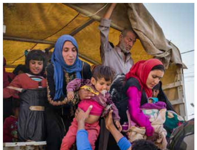
Iraq. Internally displaced persons flee to Debagha as Mosul assault begins