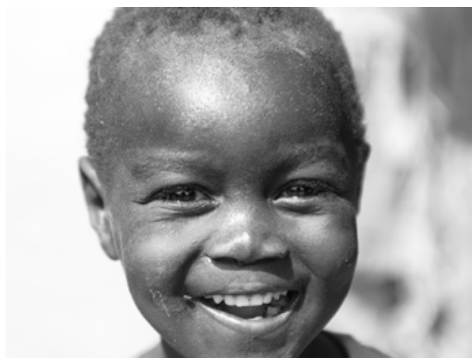
A South Sudanese boy who fled with his family from South Sudan due to the ongoing conflict, sitting outside his home in Jabarona, one of twelve open areas in Sudan.