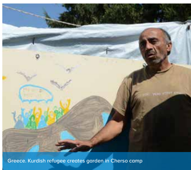
Greece. Kurdish refugee creates garden in Cherso camp

As the number of refugees coming to Ireland and Europe grows, so too does interest in the effect these new arrivals will have on Irish life