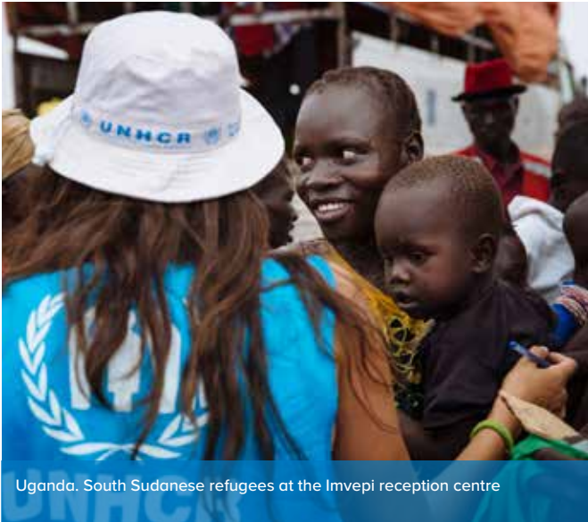
Uganda. South Sudanese refugees at the Imvepi reception centre

A clear distinction between fact and conjecture is essential. A blurring of this line can have alarming consequences.