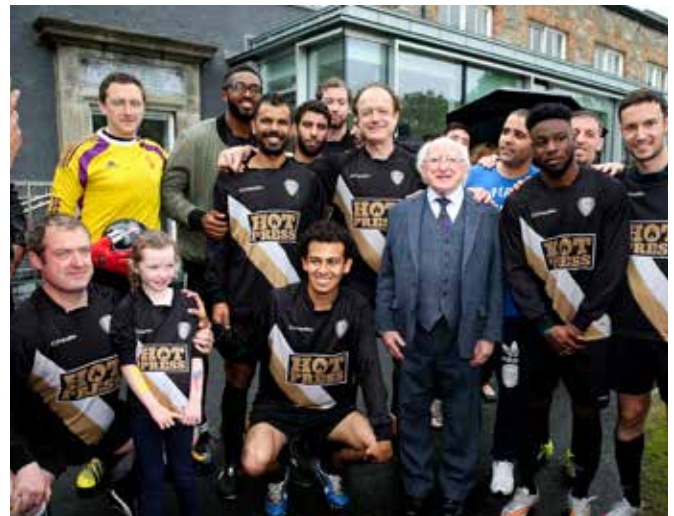
President Higgins at the 2016 Fair Play Football Cup

Refugee resettlement is the selection and transfer of refugees from a state in which they have sought protection to a third country that admits them — as refugees — with a permanent residence status. Resettlement is a protection tool for refugees whose lives and liberty are at risk. It is a ‘durable solution’ for refugees alongside local integration and voluntary repatriation and an expression of solidarity with those developing countries that host the majority of the world’s refugees.