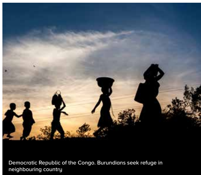
Democratic Republic of the Congo. Burundians seek refuge in neighbouring country