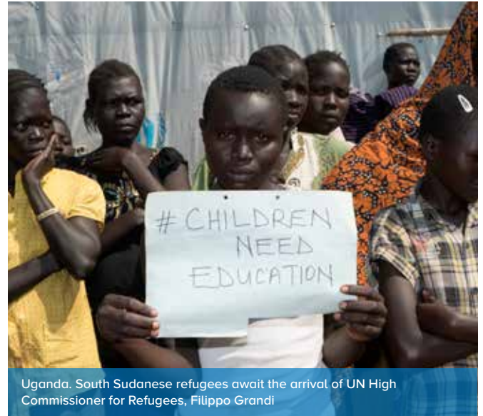
Uganda. South Sudanese refugees await the arrival of UN High Commissioner for Refugees, Filippo Grandi

People who don't qualify for protection as refugees will not receive refugee status and may be deported. But calling someone a bogus asylum-seeker is the same as calling a defendant a 'bogus defendant'. It is nonsensical.