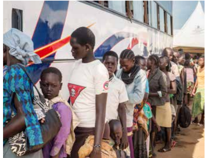
Uganda. Fleeing conflict, South Sudanese seek refuge in Uganda

Conversely, trafficking of human beings is rarely with the consent of the trafficked individual. Trafficking specifically targets the trafficked person as an object of criminal exploitation. The purpose from the beginning of the trafficking enterprise is to profit from the exploitation of the victim. It follows that fraud, force or coercion all plays a major role in trafficking. It is often the case that trafficked individuals will be exploited at the destination as part of some form of forced labour exploitation.