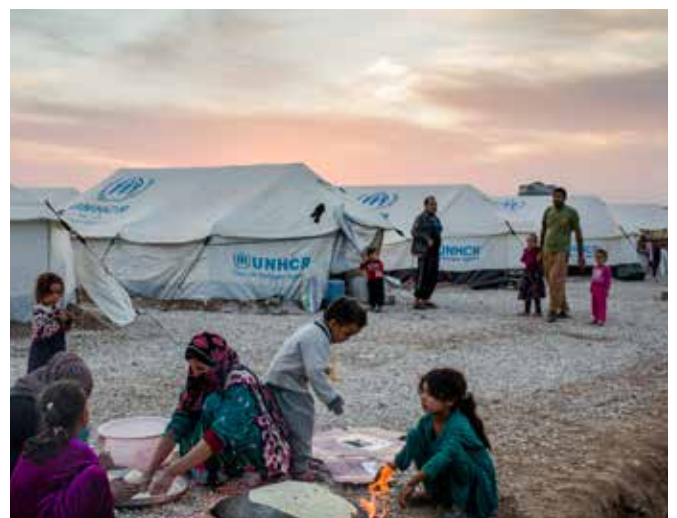
Iraq. Internally displaced Iraqis flee fighting in Mosul