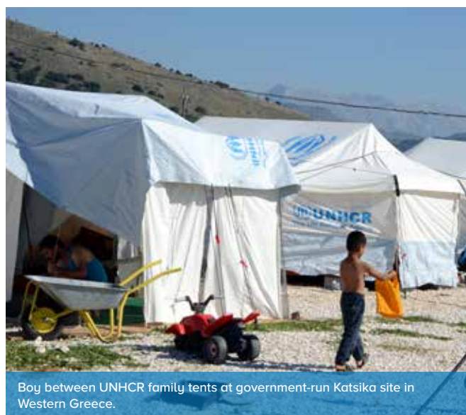
Boy between UNHCR family tents at government-run Katsika site in Western Greece.

There has been an abundance of reporting on so-called ‘pull’ factors which attract people to Ireland.