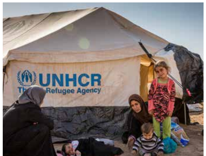
Iraq. Mosul offensive causes mass displacement

Asylum-seekers are people seeking protection as refugees, who are waiting for the government to decide on their applications.