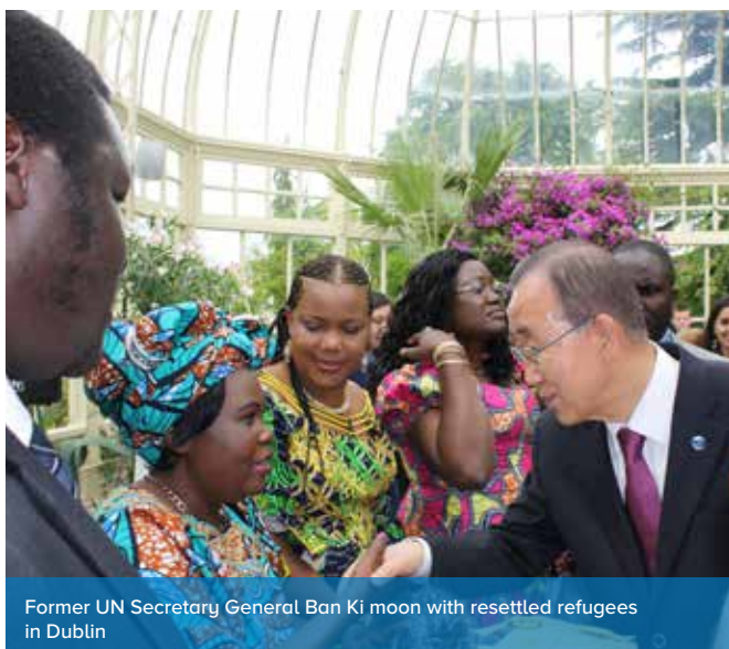
Former UN Secretary General Ban Ki moon with resettled refugees in Dublin

A separated child may have an asylum claim. They have unique challenges, including the need for safe accommodation and assistance with presenting their asylum claims, if they need asylum.