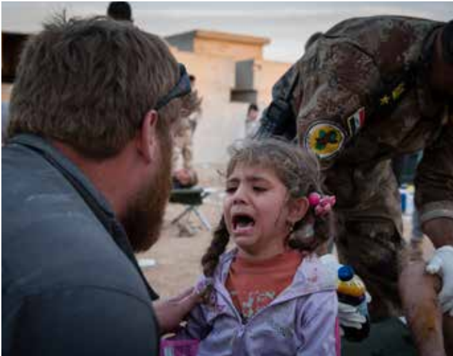
Iraq. Internally displaced Iraqis flee fighting in Mosul

People fleeing persecution leave families behind who may face retribution from repressive regimes as a result of the identification of relatives in Ireland