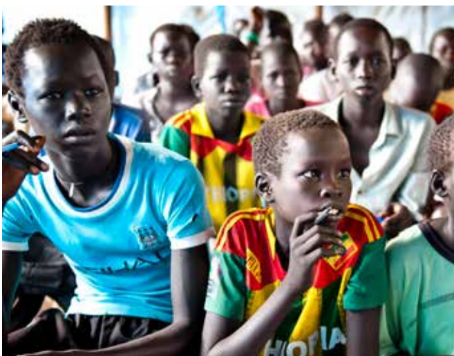
Ethiopia / South Sudanese Refugees /Gatdet, 11, and his brothers (not shown) return to school after receiving books

People fleeing persecution leave families behind who may face retribution from repressive regimes as a result of the identification of relatives in Ireland