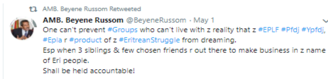
Figure 5: Tweet by Ambassador Beyene Russom