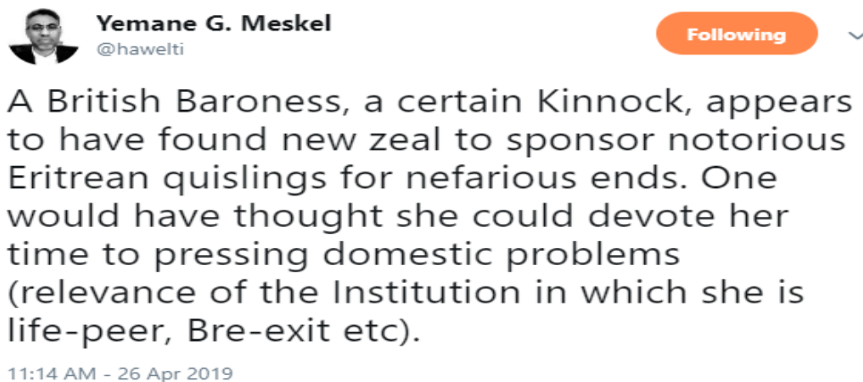
Figure 4: Tweet by Yemane Gebre Meskel, Minister of Information

democracy in Eritrea following the rapprochement with Ethiopia. 69